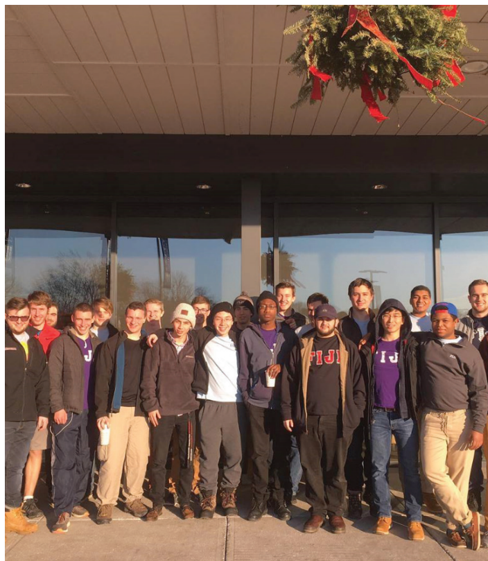
Brothers and rushees went snow tubing and enjoyed a meal at Chipotle. Rush was a success this year!