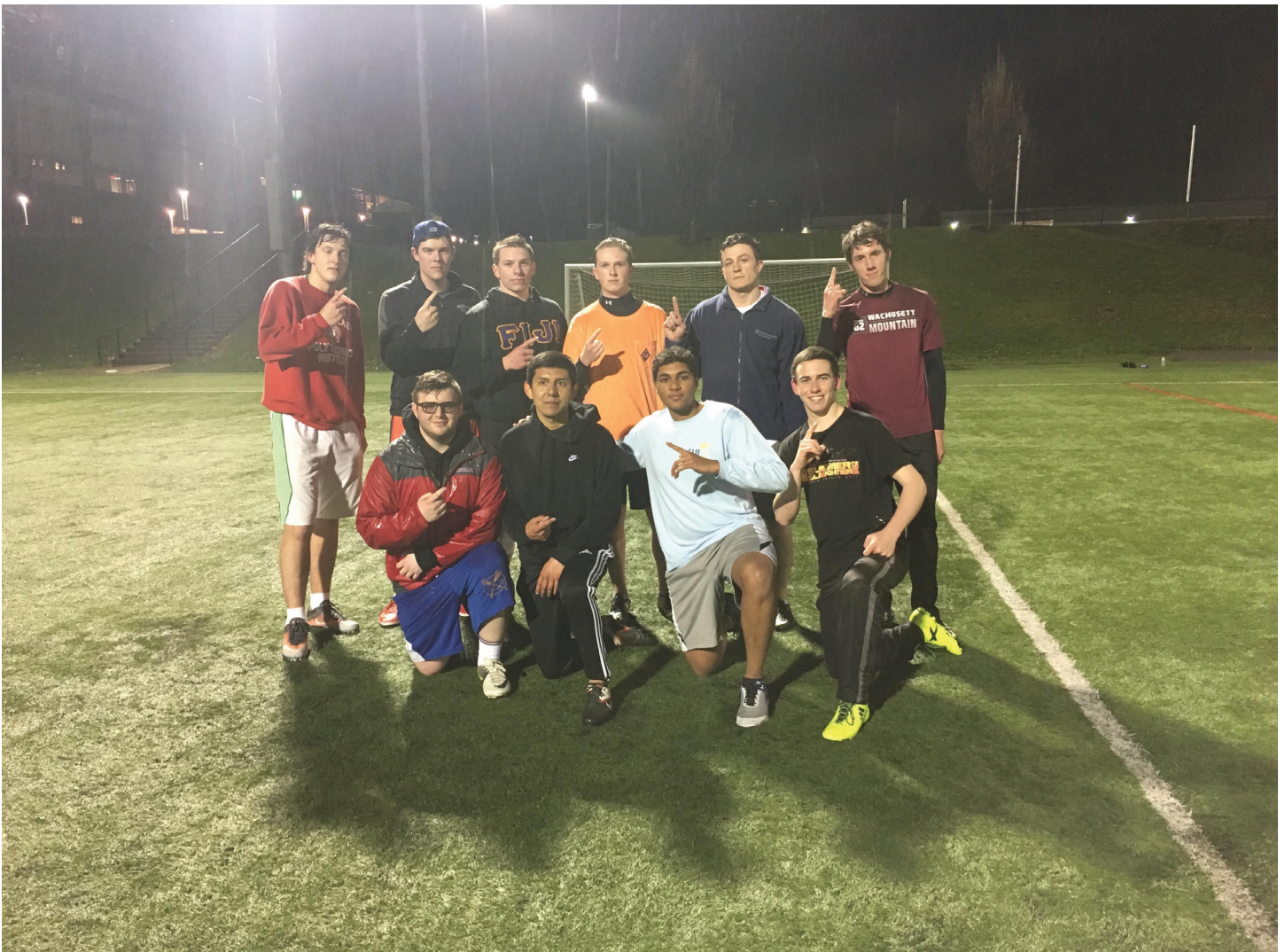
Our brothers strike a pose after defeating Sigma Chi in the Intramural Frisbee Championship #shirtszn

We are maintaining our strong presence in the intramural sports on campus. This past fall, we participated in dodgeball, basketball, ultimate frisbee, outdoor soccer, touch football, ice hockey, volleyball, kickball, and indoor soccer. Ice hockey, only recently introduced, is one of our most popular sports, boasting the largest brotherhood participation. We play regularly, and many brothers will jump at the opportunity to be on the ice, even outside of intramural games. Sports continue to be an important part of the Tau Nu experience, providing undergraduates with time to relax and have fun with pledges and brothers alike.