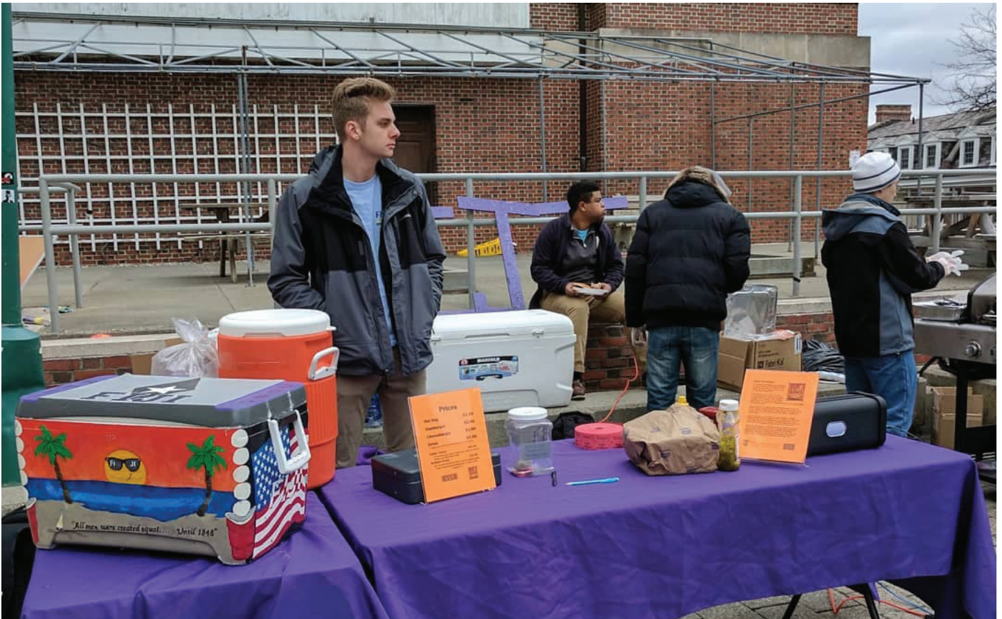
Brothers selling food during Islander week. Although sunlight and warmth was missing, we still managed to have a good time!

The end of April brought along FIJI's annual Islander event. This year, FIJI raised money for the United Service Organization, a national charity that raises money for veterans and their