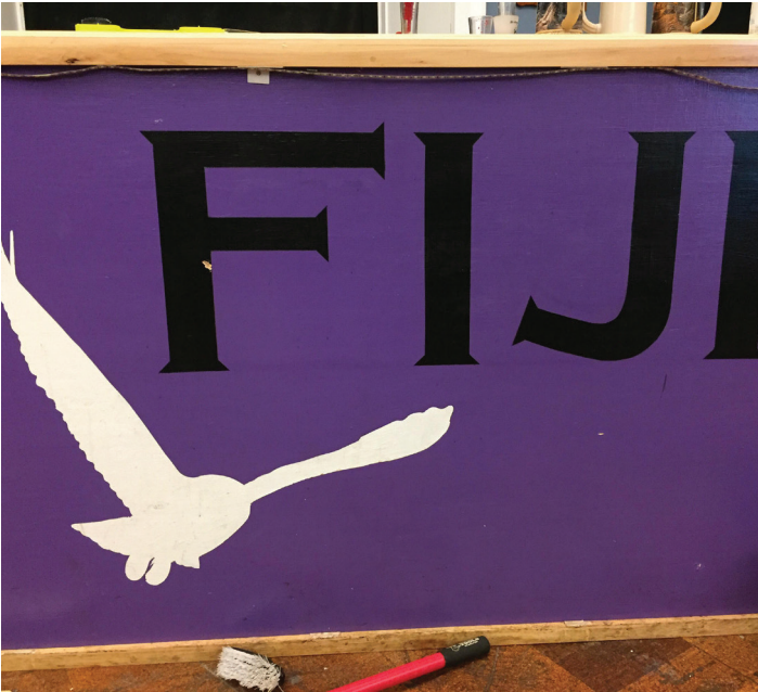
Gamma the Owl and "FIJI" adorn one side of our bar...

Graduate Housing has made major strides this semester in improving the house after the completion of the steeple painting. Not even two months into the semester, House Corp has repointed bricks in the recycling room to advance the kitchen pantry project, scheduled the installation of exit lights in the sanctuary, and ordered a newer and safer commercial range for the kitchen. Contractors are scheduled to visit the house weekly for several ongoing projects, including replacement of alleyway steps, refinishing of residential exterior windows, refinishing of rec room windows, and installation of storm windows to insulate dorm rooms.