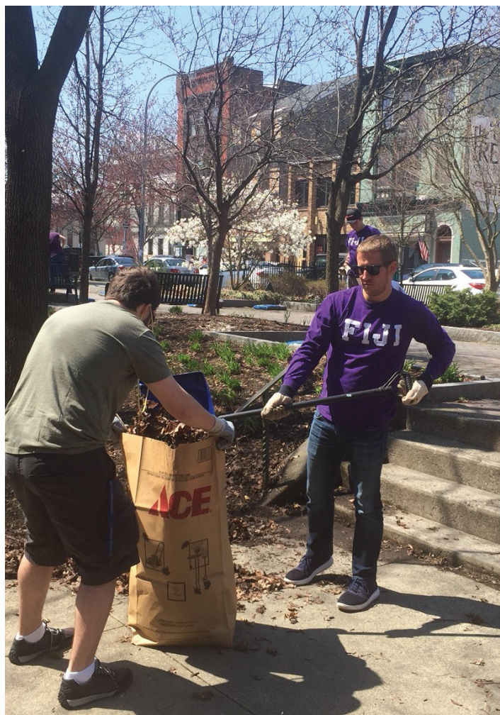
Undergraduate and Graduate Brothers helped clean up Barker Park during our annual Grad Weekend.