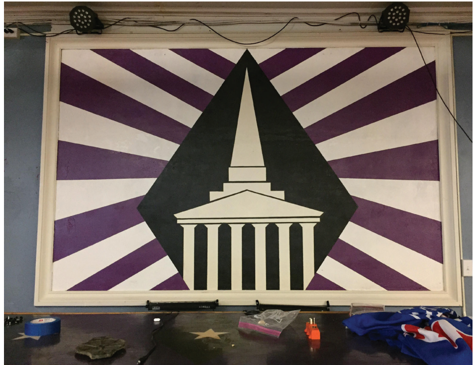
Brother Mays painted this mural to replace Rec Room Jesus.

After the trial run last semester, the cleaning system has been revamped to more efficiently clean the house. Daily tasks for garbage and recycling are scheduled more frequently to ensure proper disposal, while less impactful daily tasks have been removed. Floor managers are being reintroduced to better facilitate work party and ensure thoroughness. In true FIJI spirit, brothers continue to make small weekly house improvements during work party.